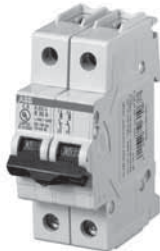
S202U-K, 2 pole