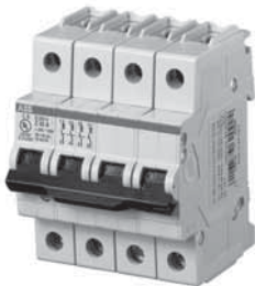
S204U-K, 4 pole